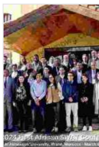
Image Alt Attribute: A group of scientists and researchers gathered at a conference, engaging in discussions and exchanging ideas.