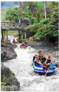
Photo book Rafting Phang Nga : Photo book Rafting in Thailand enjoy eco-tours and outdoor adventure activities such as elephant trekking, bamboo rafting and white water rafting (Amazing Thailand 1)

Are you looking for an unforgettable adventure that combines the thrill of white-water rafting with the opportunity to capture stunning images of the surrounding landscape? If so, then photo rafting in Thailand is the perfect activity for you.