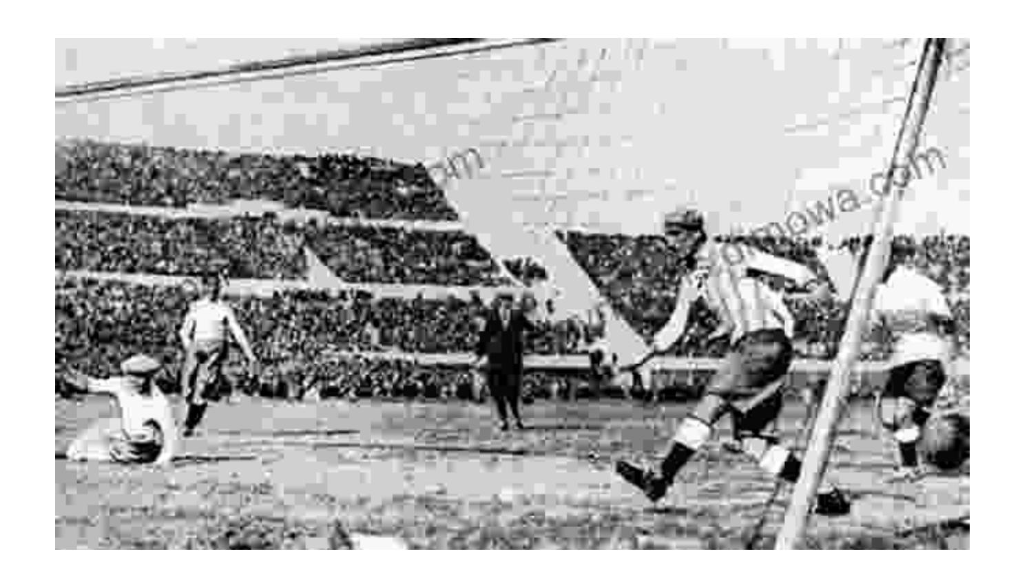
The first World Cup final between Uruguay and Argentina

The first international soccer match was played in 1872 between England and Scotland. The match was a friendly and ended in a 0-0 draw. However, it paved the way for the development of international soccer competitions. In 1904, the Fédération Internationale de Football Association (FIFA) was founded in Paris. FIFA is the governing body for international soccer and is responsible for organizing the World Cup, the most prestigious soccer tournament in the world. The first World Cup was held in Uruguay in 1930 and was won by the host nation. Since then, the World Cup has been held every four years, except for during the Second World War.