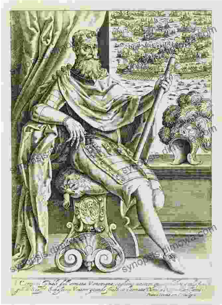
Cornelius Sulla Felix, Imperator Romanus, regnum accepit post mortem Marii, et cum esset in senatu, a Pompeio magno, Sulla, Pompeio, et Crasso, interfectus. Pompeius in regno