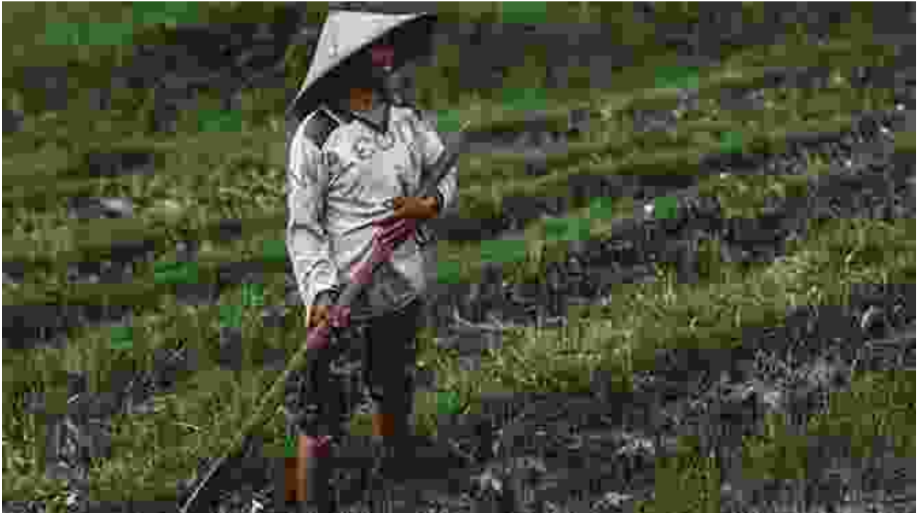
A poignant capture of the resilience of rural America