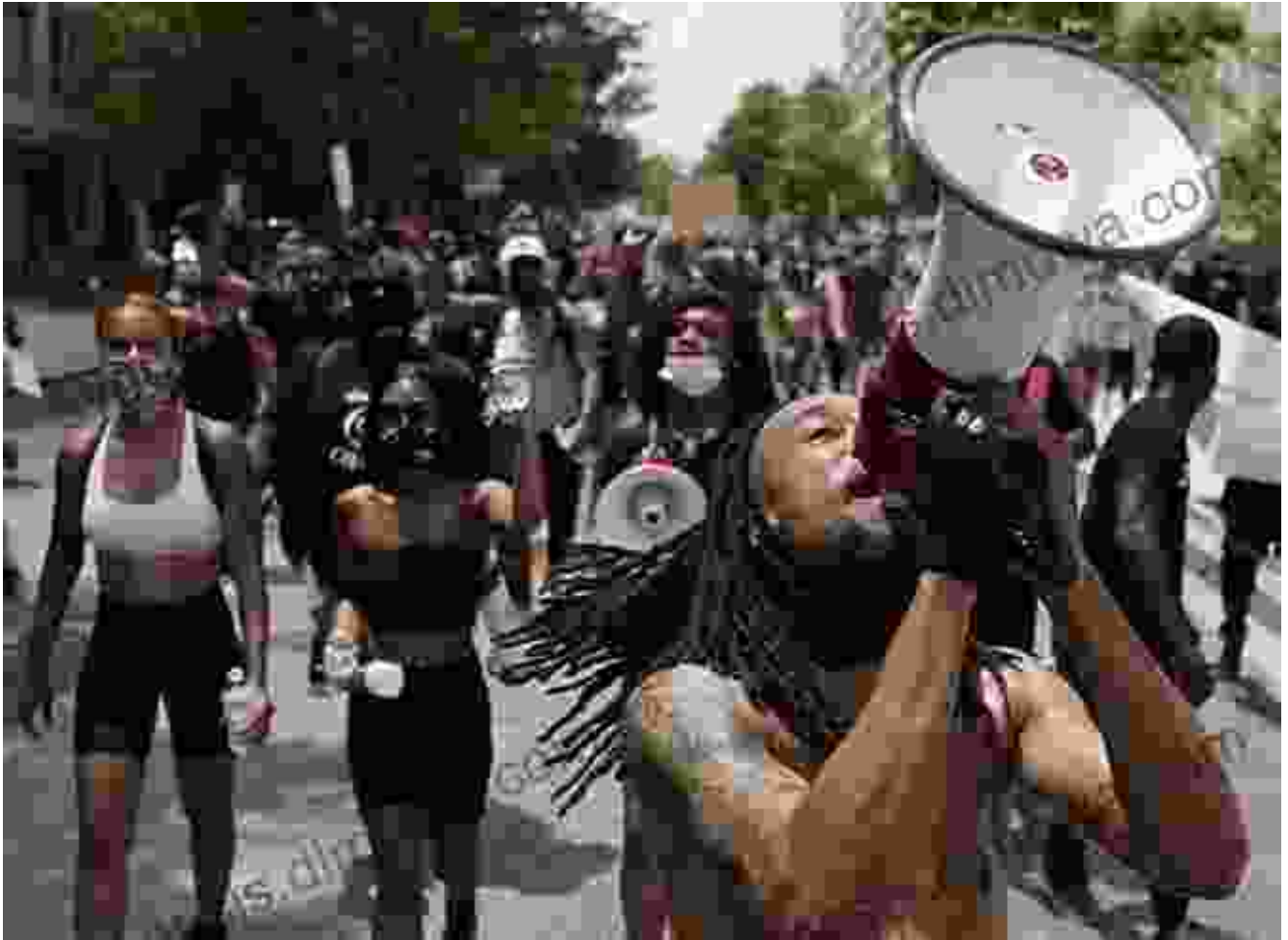
A powerful image that captures the political tensions that pervade American society