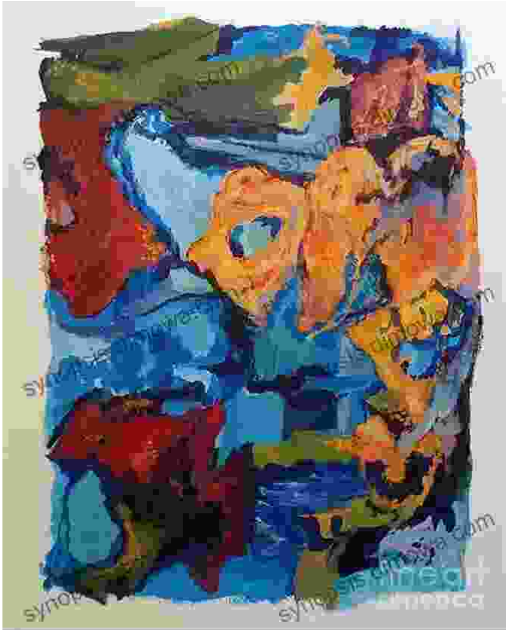
Untitled, acrylic on canvas, 2023