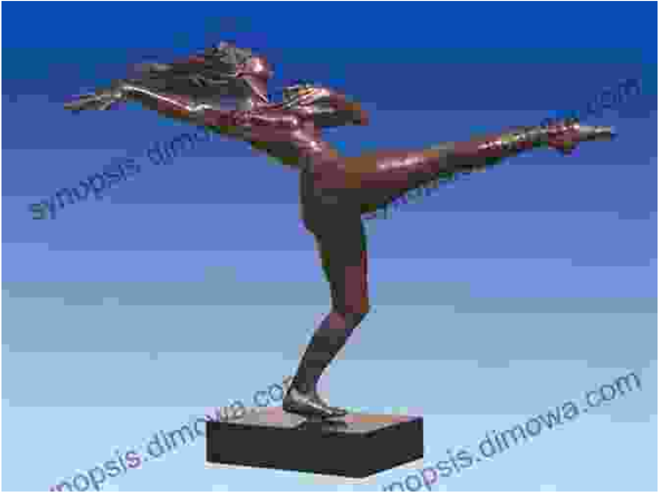
The Dancer, bronze, 2021