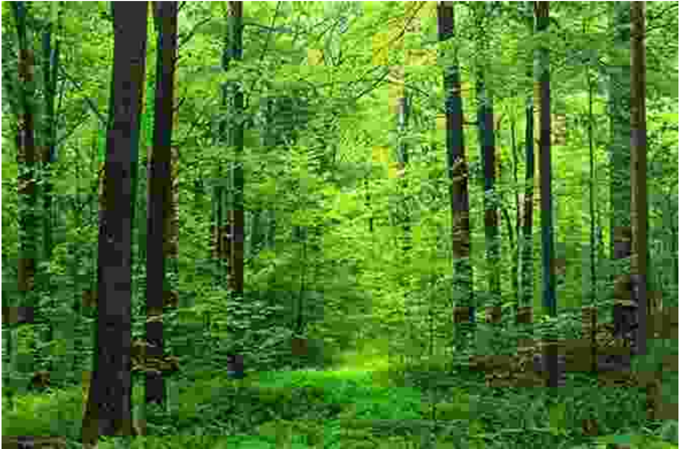
Forest Shadows, 2022